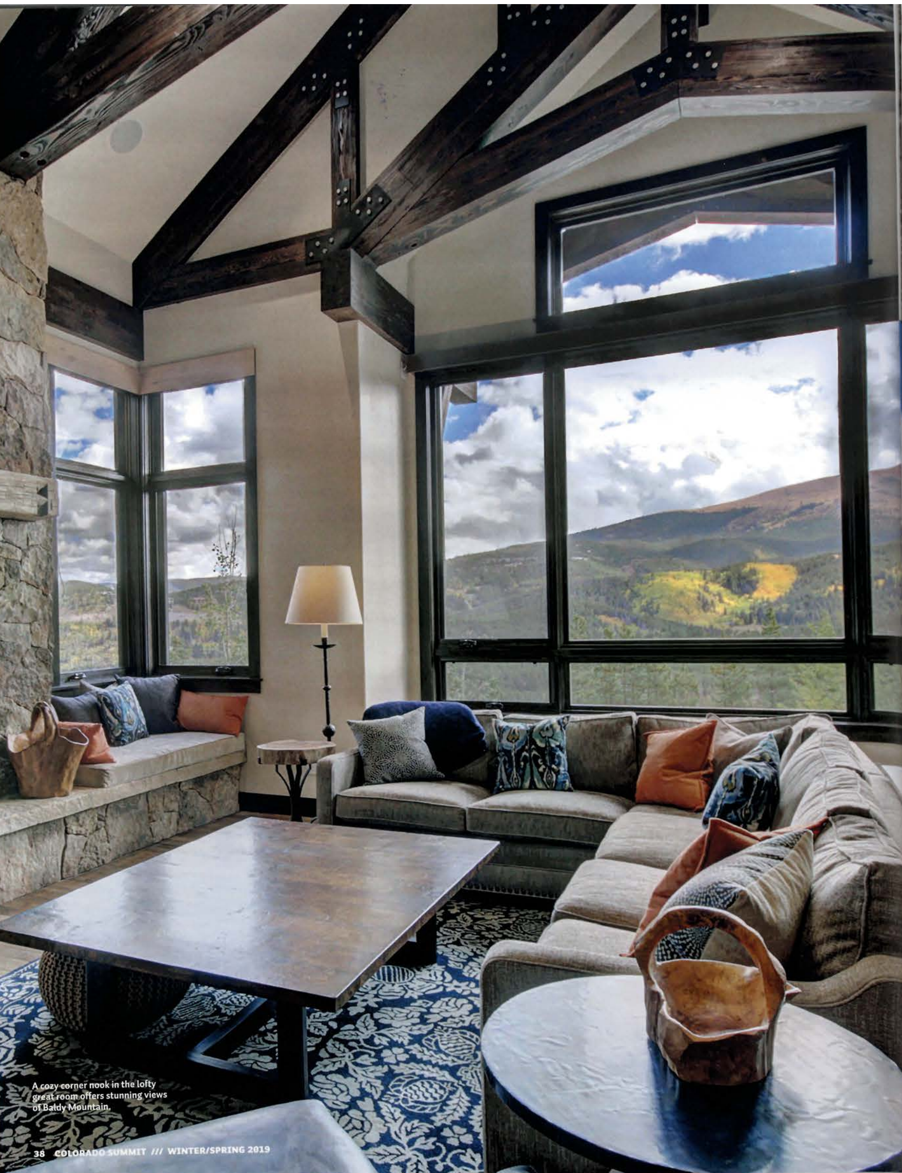
A cozy corner nook in the lofty great room offers stunning views of Baldy Mountain.