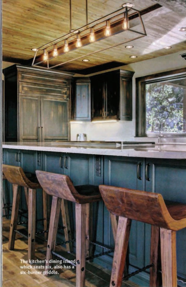
The kitchen's dining island, which seats six, also has a six-burner griddle.