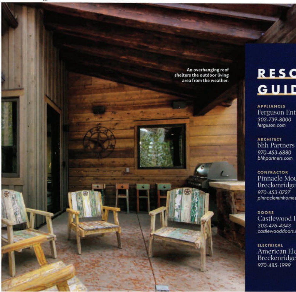
An overhanging roof shelters the outdoor living area from the weather.

That functionality, she says, is on-trend for the utilitarian vacation mountain homes being designed today, investments maximized for entertaining and accommodating large groups and meant to be occupied year-round, unlike the maxed-out trophy homes of old that were designed for a single family and remain vacant for all but two weeks of the year. The Hawk’s Hideaway dining table seats 12, with extra counter seating for six at the atoll-size island in the nearby kitchen, an expansive space that’s bigger than some condos and is better equipped than many commercial kitchens. For the Smiths, shared meal preparation is part of the vacation experience, “hence the two dishwashers and two ovens,” points out Smith. She recalls »